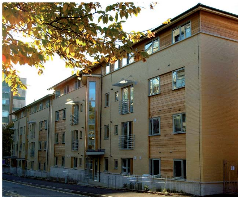
Pictured: Upper Quay Street, Gloucester

Signpost Homes is now established as a UK top 20 student housing provider.