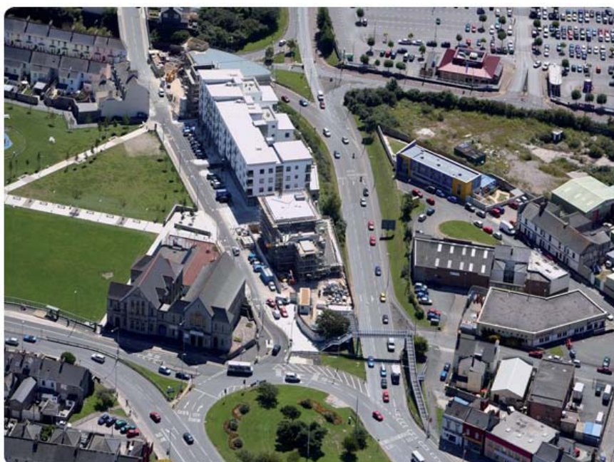
Pictured: the East End Community Village